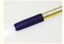
Glare guard sleeve