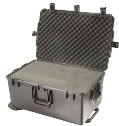
iM2975-X0001 With Foam