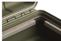
iM29XX-BEZEL Base Bezel Kit