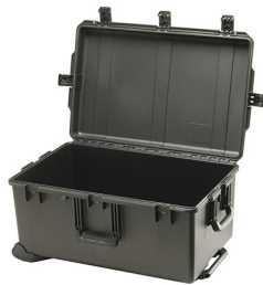
iM2975-X0000 No Foam