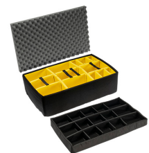
iM2975-DIV Padded Divider Set