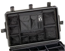
iM29XX-UTILITYORG Utility Organizer