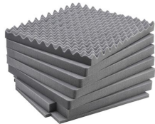
iM2875-FOAM 7 pc. Replacement Foam Set