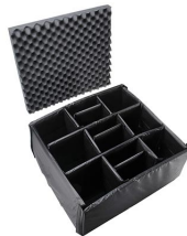
iM2875-DIV Padded Divider Set