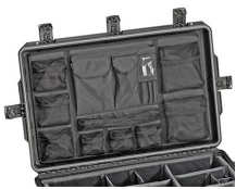
iM2875-UTILITYORG Utility Organizer