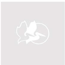
iM2600-M4-BEZEL-L Lid Bezel (Metric)