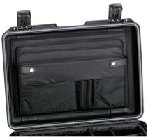
iM26XX-LIDORG Lid Organizer