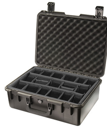
iM2600-X0002 With Padded Dividers