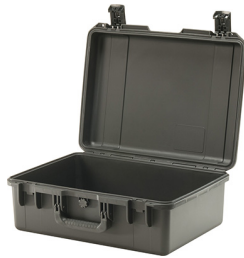
iM2600-X0000 No Foam