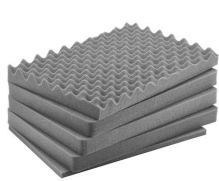
iM2600-FOAM 5 pc. Replacement Foam Set