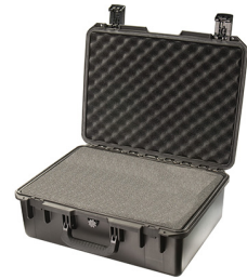
iM2600-X0001 With Foam