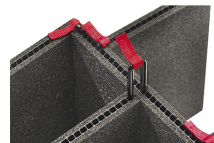
iM2600-TREK TrekPak Case Divider Kit