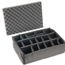
iM2600-DIV Padded Divider Set