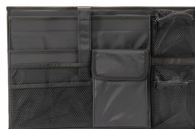
iM26XX-UTILITYORG Utility Organizer