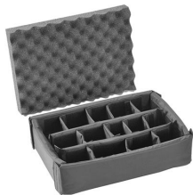
iM2200-DIV Padded Divider Set