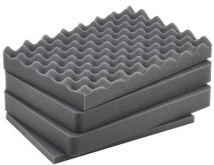
iM2200-FOAM 4 pc. Replacement Foam Set