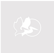
iM2200-MBEZ-B Base Bezel (Metric)