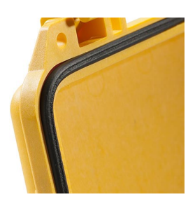
1723 Replacement O-ring