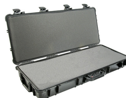
1700WF With Foam