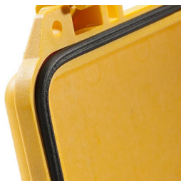
1703 Replacement O-ring