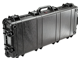
1700NF No Foam