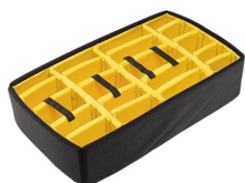
1675 Padded Divider Set