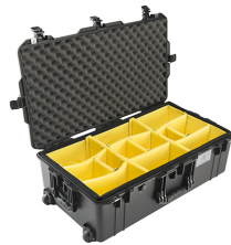
1615WD With Padded Dividers