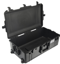
1615NF No Foam