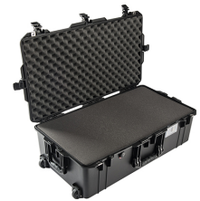
1615WF With Foam