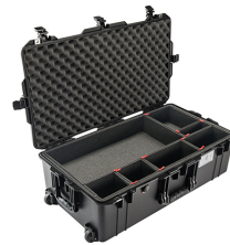
1615TP With TrekPak Divider System