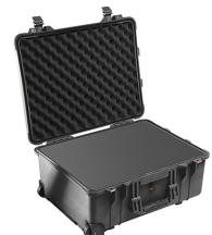
1560WF With Foam