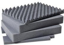
1561 4 pc. Replacement Foam Set