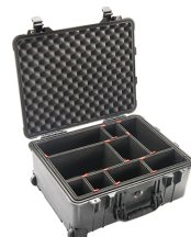
1560TP With TrekPak Divider System