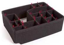
1560EUTP TrekPak Case Divider Kit