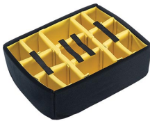
1565 Padded Divider Set