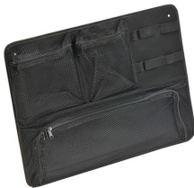
1569 Lid Organizer