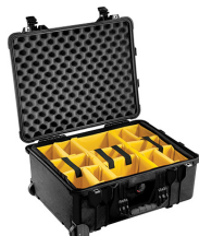
1564 With Padded Dividers