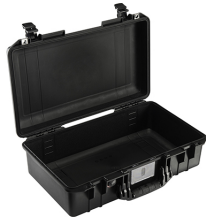
1525NF No Foam