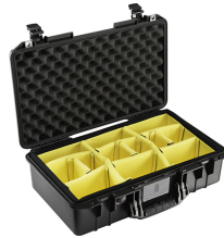
1525WD With Padded Dividers