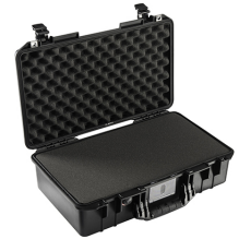
1525WF With Foam