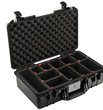
1525TP With TrekPak Divider System