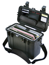
1437 With Padded Office Divider Set & Lid Organizer