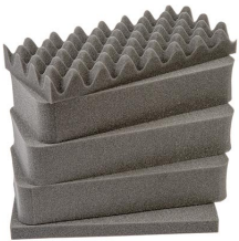
1431 5 pc. Replacement Foam Set