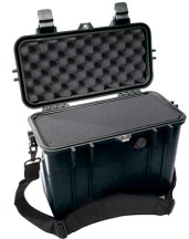
1430WF With Foam