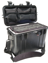
1434 With Padded Dividers & Lid Organizer