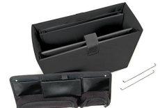
1436 Office Divider Kit