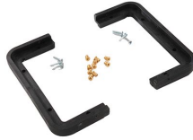
1430PF Special Application Panel Frame