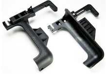
1438 Boat Bracket Kit