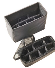
1435 Padded Divider Set