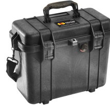
1430NF No Foam