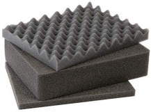
1201 3 pc. Replacement Foam Set