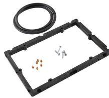
1200PF Special Application Panel Frame