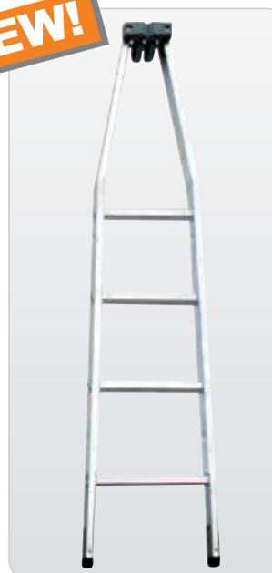
Fig. Order No. 12009