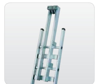
Fig. Order No. 19280

Attachable section with rollers and lay-on rubber pad, suitable for straight ladders, push-up and rope-operated ladder.