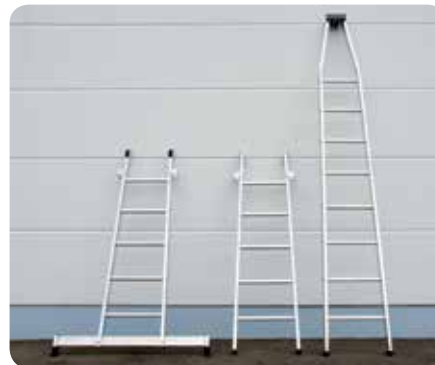
Fig. Order No. 12005 – 12006 – 12008