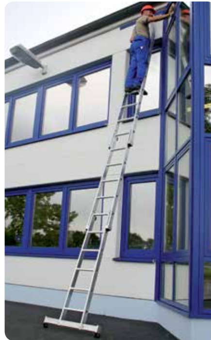
Fig. Order No. 11018