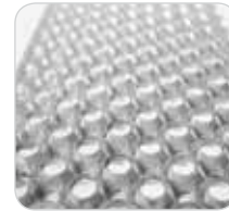
Perforated sheet made of aluminium