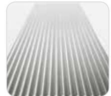
Deeply grooved aluminium