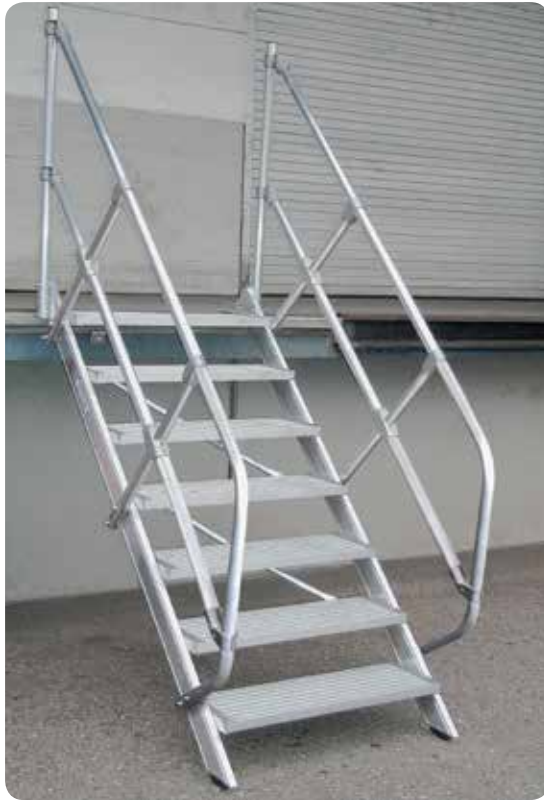
Fig. Order No. 300247 with second handrail order No. 300307

The standard version is made of grooved aluminium. Other covers at an extra charge (see page 84).