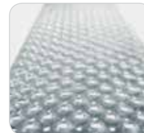
Perforated sheet made of steel