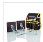
Practical aids 2