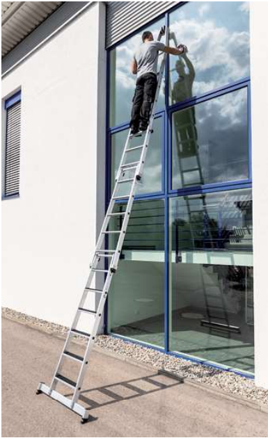
Fig. Order no. 12011 with order no. 12012 and order no. 12013