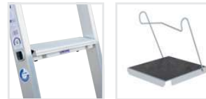
Step module MaxxStep Order no. 19901-19905