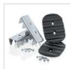
Secure footing outdoors