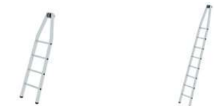
Practical aids 1