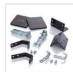
Ladder head protection, complete set