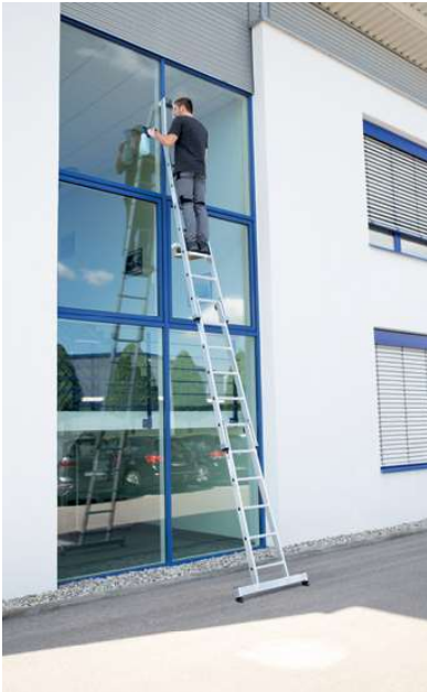
Fig.: Order no. 11018 with order no. 19910