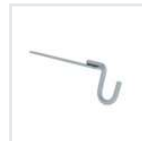
Bucket hook Order no. 19115