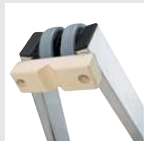
Rubber pad with wedge cut-out