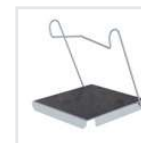
R 13 hook-in step Order no. 19910