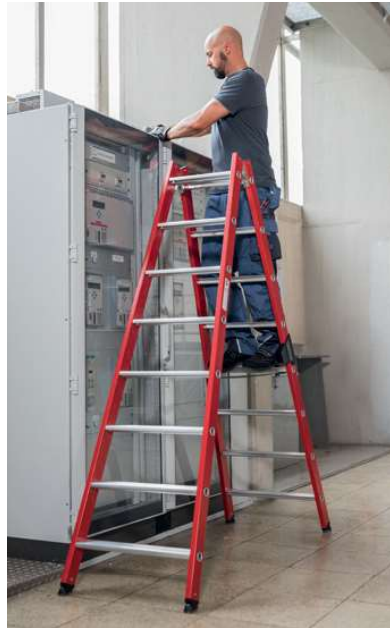
Fig.: Order no. 34116