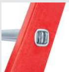
4-fold edged step-to-side-rail connection

Details on the relevant product page at www.steigtechnik.de