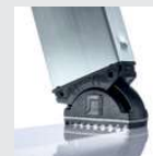
nivello® ladder shoes