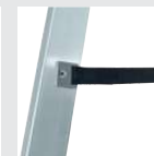
Spreader lock with two high-strength nylon straps