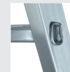
4-fold edged rung-to- side-rail connection

Details on the relevant product page at www.steigtechnik.de