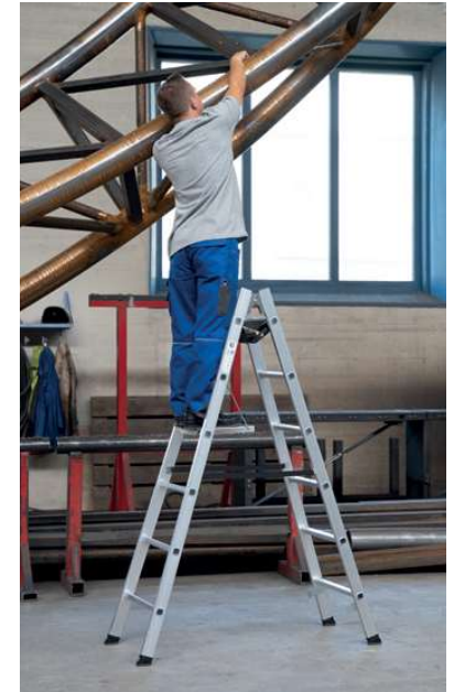
Fig.: Order no. 33012 and order no. 19910