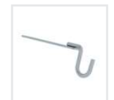
Bucket hook Order no. 19115