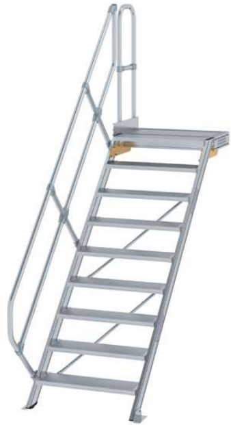
Fig.: Order no. 600449