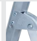
4-fold riveted ladder joint