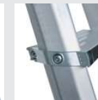
High-strength bolted step-to-side-rail connection

Details on the relevant product page at www.steigtechnik.de