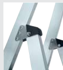
'safe-cap' ladder joint