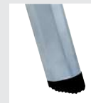
Non-slip ladder shoes