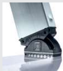
nivello® ladder shoes