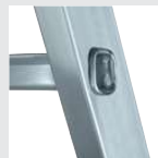
4-fold edged step-to-side-rail connection

Details on the relevant product page at www.steigtechnik.de