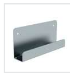
Wall-mounted ladder holder L Order no. 19839