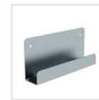
Wall-mounted ladder holder L Order no. 19839