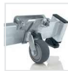
'Roll-bar' retrofit kit Order no. 19634