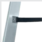
Spreader lock with two high-strength polyester straps