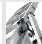
Fittings with sliding guides