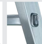
4-fold edged rung-to-side-rail connection

Details on the relevant product page at www.steigtechnik.de