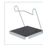
R 13 hook-in step Order no. 19910