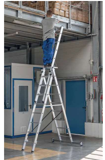
Fig.: Order no. 33308 and order no. 19910