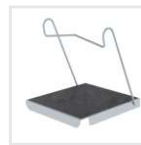
R 13 hook-in step Order no. 19910