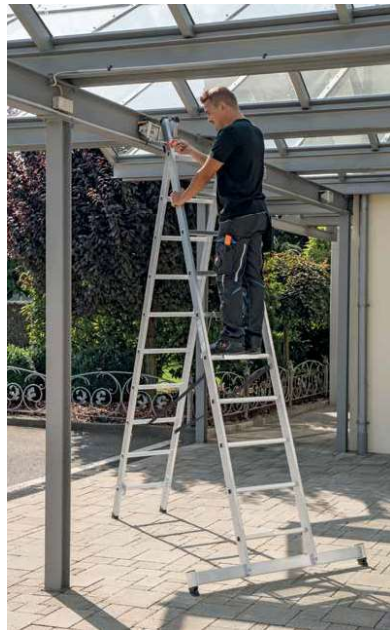
Fig.: Order no. 31220 and order no. 19910