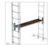
Bridging platform kit Order no. 30299