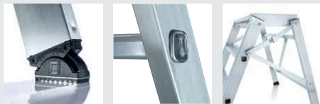
nivello® ladder shoes