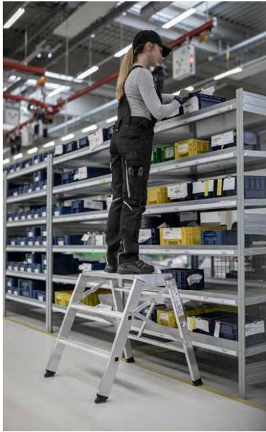
Fig.: Order no. 50006