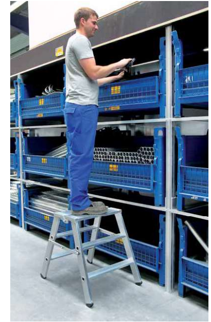
Fig.: Order no. 50095