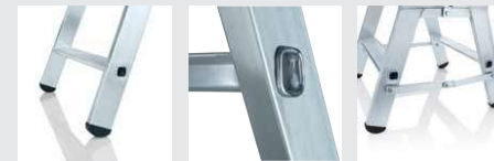
Non-slip plastic shoes