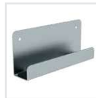
Wall-mounted ladder holder L Order no. 19839